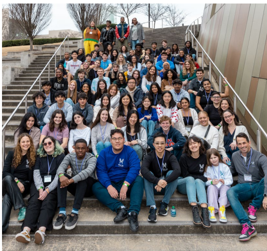
PHOTO (BELOW): WE VISITED THE NATIONAL CENTER FOR HUMAN AND CIVIL RIGHTS WHERE OUR FELLOWS LEARNED ABOUT THE HISTORY OF YOUTH CHANGEMAKERS.