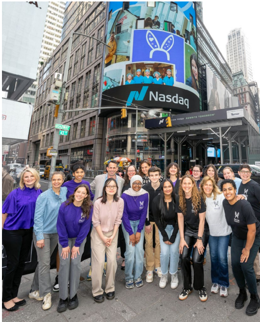
PHOTO (ABOVE): RILEY'S WAY WAS FEATURED ON THE NASDAQ TOWER TO CELEBRATE OUR FELLOWS.

Every year we have a special category chosen by our youth community. The 2024-2025 Special Category is Education Equity. We also expanded our Sponsored Categories to include the Interfaith Connections Award sponsored by the Sandler Family, and A Kinder World For Animals Award sponsored by A Kinder World Foundation.